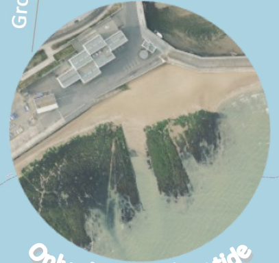
Only visible at low tide